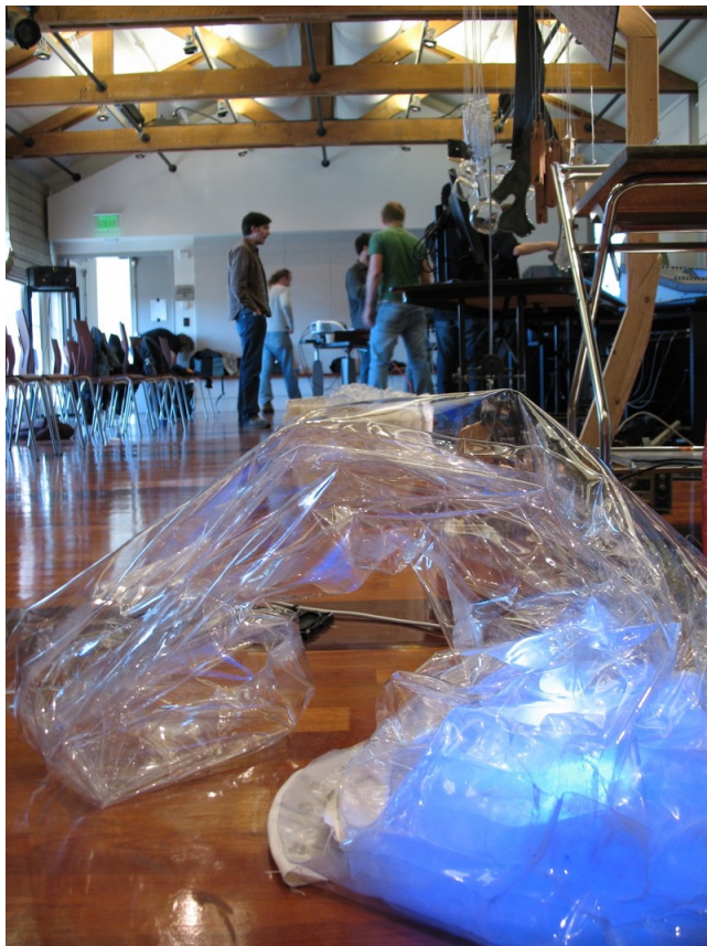
Figure 3. The death of the bop bag

These type of responses in two dimensions do not yield a simple 1:1 mapping as the initial coupling would suggest, but rather a complex control relationship that forces the user to address the needs of the machine and meet it halfway, possibly changing the user's attack strategy on the bop bag; yet, because both the controller and sound generator were visible physical systems, the mapping was not obscure. Users and observers were able to understand the dynamics of the system based on their knowledge of physical systems obtain throughout their life. A response like this also requires the user to become even more somatically engaged in the performance, creating a fun, visually exciting, and "expressive" performance for all involved.