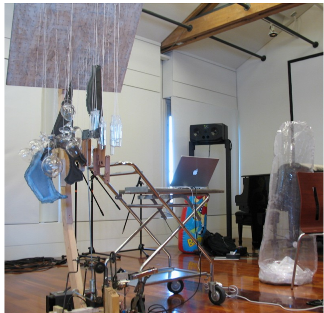
Figure 1. Rage in Conjunction with the Machine

While the concept behind a 5' joystick controlling the movement of a metal rod in a sea of percussion is rather simple, the unique choices of controller and sound generator provide solutions to what the authors consider common problems of NIMes in a performance environment.